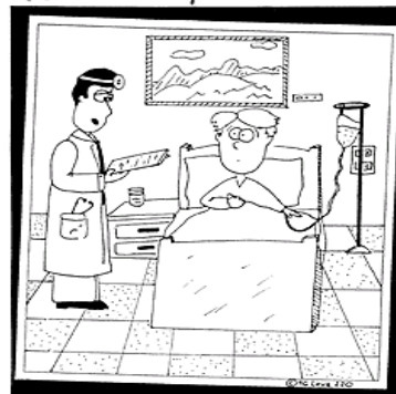
SNAPSHOTS by Jason Love

"Well, it's a good thing you switched cigarettes, Bob...You only have cancer light ."